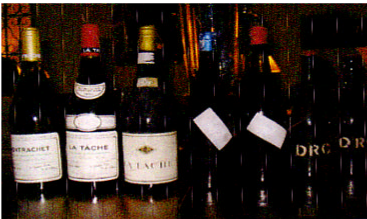
From left to right: '79 DRC Montrachet, '80 DRC La Tâche, '23 Nicolas/Liger-Belair La Tâche, '29 DRC Les Gaudichots, '21 Nicolas/Liger-Belair La Tâche and two half bottles of 1900 Romanée-Conti.

1929 Les Gaudichots: As can be seen in the photo, this bottle possessed a blue capsule which was the style of Domaine Liger-Belair in that period; it was labeled by hand as La Tâche-Gaudichots and it's possible that it was the Liger-Belair La Tâche rather than a Domaine de la Romanée-Conti Les Gaudichots. Irrespective of these details, the wine was bricked all the way to the center. Quite closed at first, it exploded after 10 minutes or so of air, offering incredible spice notes mixed with plenty of sous bois . Remarkably, the wine improved over the course of 2 hours, becoming ever purer and more focused and